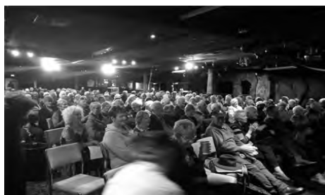
Mildura crowd enjoying the Poets Breakfast